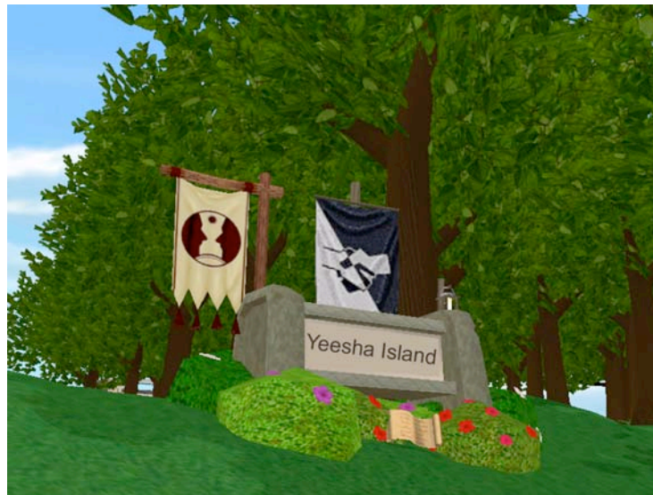
Figure 8: TGU's island settlement in There.com. The flag at right bears TGU's logo.

In contrast with Thereians’ reactions, There, Inc., then owners of There.com wanted to accommodate this large and lucrative community. They had actually been forewarned about their arrival and saw this as an opportunity to quickly absorb a large influx of paying subscribers, which were sorely needed by the struggling start-up. Eventually they identified a small island, far removed from other areas, where Uruvians could settle with minimal impact on neighboring communities. (Figure 8)