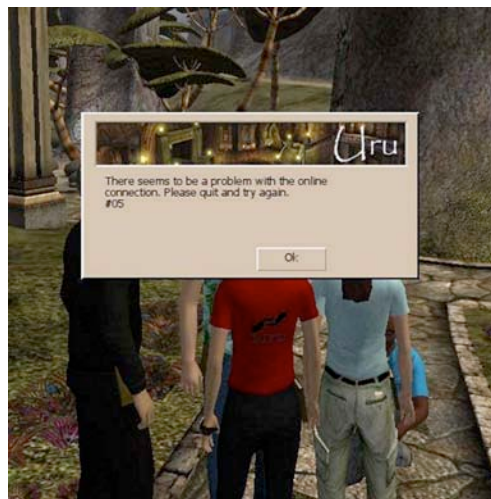
Figure 5: The final screen of Uru Prologue .

Uru was released as a CD-ROM in the Fall of 2003, but the full game was never opened to the public. Instead, the game went into a beta test, known as “Prologue,” to which players had to request an invitation. Eventually, due in part to a “clerical error,” all the players who had requested an invitation received one, and at its peak, Uru Prologue hosted 10,000 players. The following February, with only a few days warning, publisher Ubisoft and developer Cyan announced that Uru Prologue would be closing and that the full public release, Uru Live , was being canceled. Players gathered in-world for the server shutdown is remembered by players as “Black Monday” or “Black Tuesday,” depending on which time zone players were in at the time of the closure. (Figure 5)