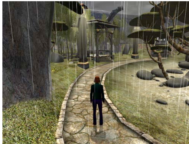
Figure 3: The introduction of a player avatar in Uru enhanced players’ sense of presence.

Finally, there is the matter of the Uru narrative itself. The narrative of Myst centered on Atrus and Catherine and their errant sons Sirrus and Achenar. The central character of Uru is their younger sister Yeesha, who has learned and exceeded her father’s craft of Age-writing. The hub of the game is the abandoned city of D’ni Ae’gura (Figure 4), housed in an underground desert cavern, and settled by the D’ni when their own world was destroyed . In other worlds, the D’ni themselves were refugees. The word “Uru” is attributed to have two meanings in the D’ni language: one, “a large gathering or community;” the other, a more informal definition, “you are you.” Players gather in the “cavern” as “Explorers,” but the implication is that they play themselves. They arrive in D’in Ae’gura long after it has been deserted, guided by cryptic clues left by Yeesha.