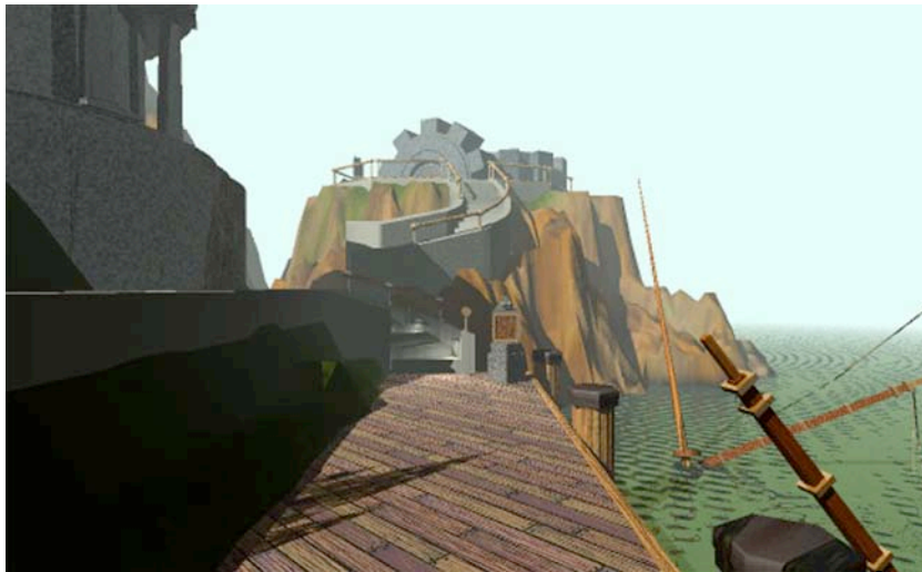
Figure 1: Myst drew players into a fully realized fictional world. 3

To lay the groundwork for understanding the dynamics of this relationship, it will be helpful to understand the nature and the history of Uru and its players. Uru: Ages Beyond Myst was one of the final games in a successful game franchise that began with Myst in 1993. (Figure 1) Myst was the first blockbuster CD-ROM game, and continued to hold its chart-topping status until it was outstripped by The Sims in 2001. Myst was classified by many as the first videogame that was truly a work of art (Rothstein 1994; Carroll 1994). It broke new ground in digital interactive narrative, established a new genre, the adventure puzzle game, raised the bar for both visual and audio design, and broadened the audience of games to women and older adults (Miller 1997). The majority of Uru players were Myst fans that had already been “living” in the Myst world for a decade when the multiplayer game launched.