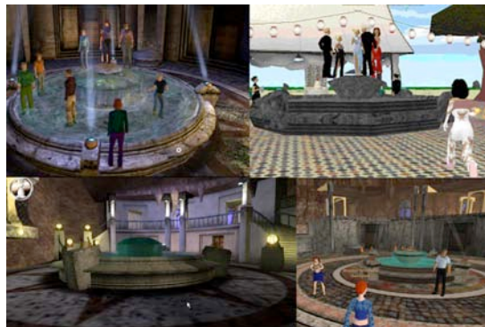
Figure 11: The Uru “hood” fountain, an important cultural artifact as instantiated in (clockwise from upper left): Uru , There.com , Atmosphere , and Second Life .

The Uru story suggests that, in graphical virtual worlds, place and identity can be tightly knit together. In the case of the Uru Diaspora, this plays out in two ways: Where players are “from” becomes a key marker of identity. In addition, in worlds like Second Life and There.com , spaces that players create through “productive play” practices also become an expression and marker of both individual and group identity (Pearce and Artemesia 2006). In a sense, the place itself becomes an “avatar,” a spatial embodiment of players’ individual and collective identities. (Figure 11)