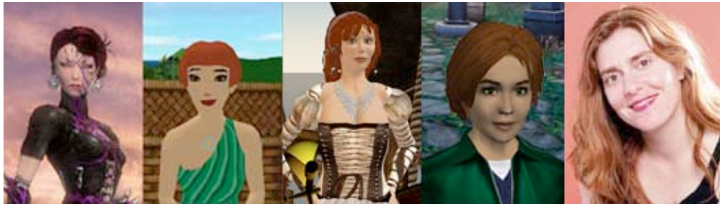
Figure 10: Artemesia's avatars in (left to right): Guild Wars, There.com, Second Life, Uru, and Real Life.

To facilitate the fieldwork, I created Artemesia, a “research avatar,” a trans-ludic character that I used and continue to use to conduct my ethnographic research. I have co-credited this character with writings on the research, and frequently given presentations or co-presentations with her “in world.” (Figure 10)