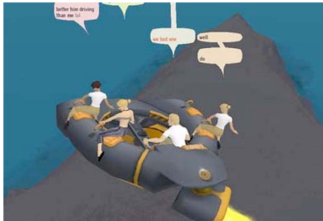
Figure 6: Scouting for a new home in There.com .

Uruvians who migrated into There.com would often refer to themselves in the collective "we." In early interviews with members of the TGU, they would highlight the differences between themselves and other gamers, and speak about their shared values. (Figure 7) "We are explorers," they would say, or "we are puzzle solvers." They were also very clear that they did not like violent games, which was one of the reasons they chose not to go to some of the MMOGs that were considered, such as Ryzom . Part of what they sought in a new home was a place with pleasing scenery that they could explore together, one of their favorite group activities in Uru . They also wanted an environment that was easy to learn and use and support their main objective, which was being together.