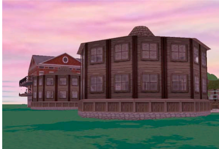
Figure 9: The University of There campus features Uru-influenced cone houses.

University of There, a large campus that hosts free educational activities open to all Thereians. (Figure 9) At one point, when There.com was threatened with closure, rather than abandon ship as many players, Uru refugees stood their ground and helped assure that their new home remained open.