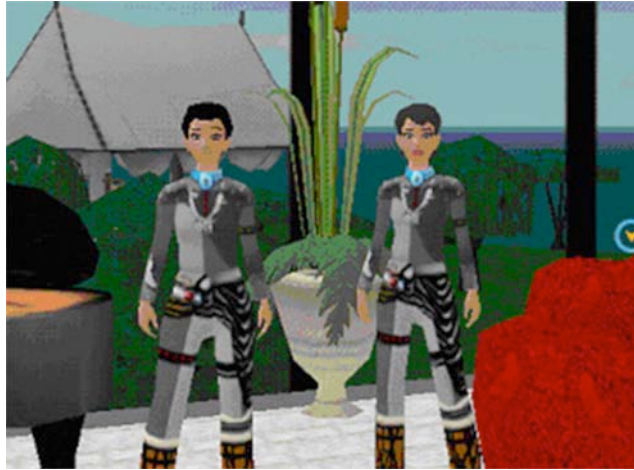
Figure 7: Uru refugees in player-created ethnic garb.

Initially, the Uru refugees were ostracized by native Thereians for a number of reasons. First, the group size, which, when joined by not-TGU Uruvian refugees, swelled to around 450 at its peak, was perceived as a threat to the small and nascent Thereian culture. Second, Thereians feared that the incoming immigrations would try to take over There.com and make into Uru . In fact, Uruvians did try early on to recreate Uru in one area of the world, but due to the constraints of There.com 's building apparatus, they were unable to realize this plan except through emergent and incremental means.